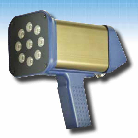
ST-320BL Black Light LED Stroboscope

The ST-320BL is designed for speed and frequency measurements in the printing, packaging, textile, automotive, cable, mining, steel, chemical, optical and medical industries in various applications.