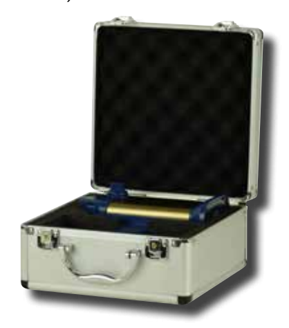
ST-320BL in Included Metal Carrying Case